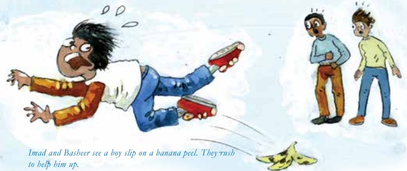
Imad and Basheer see a boy slip on a banana peel. They rush to help him up.