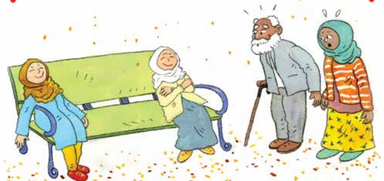
Each girl sits on the opposite end of the bench.